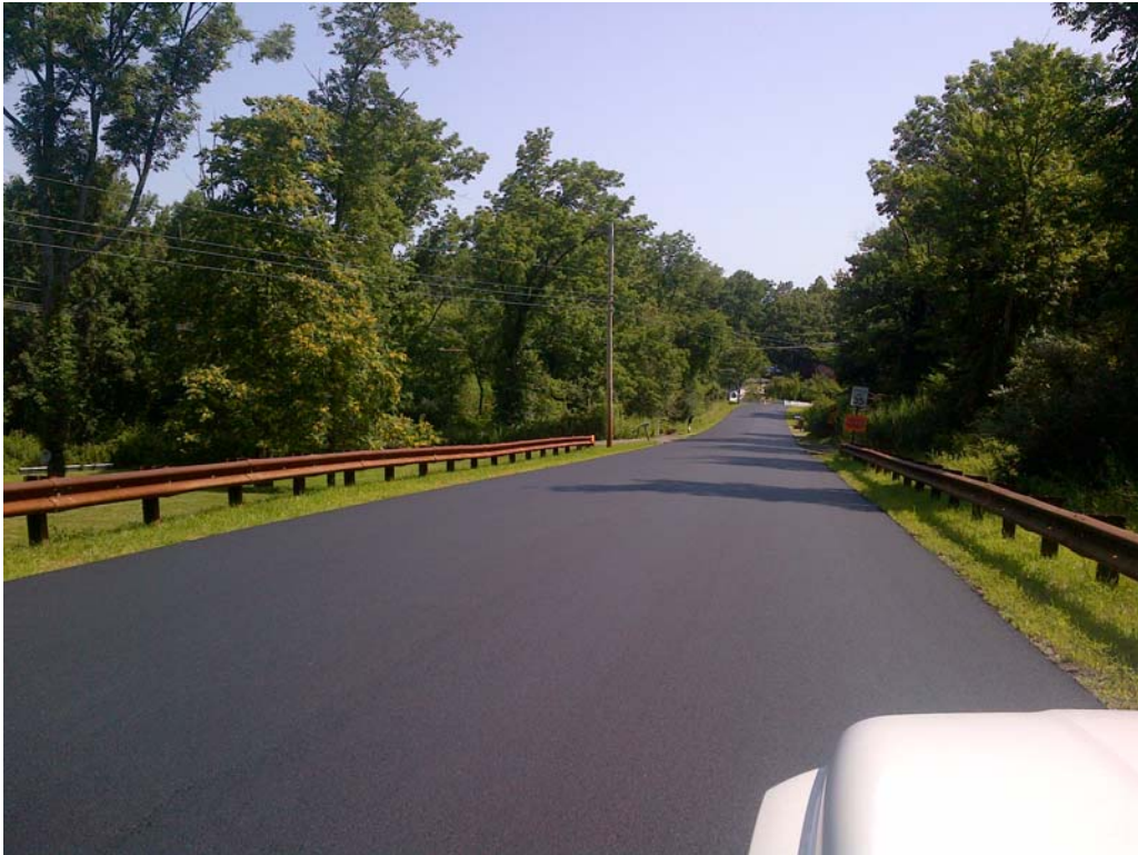
Figure 4: Sterling Hill