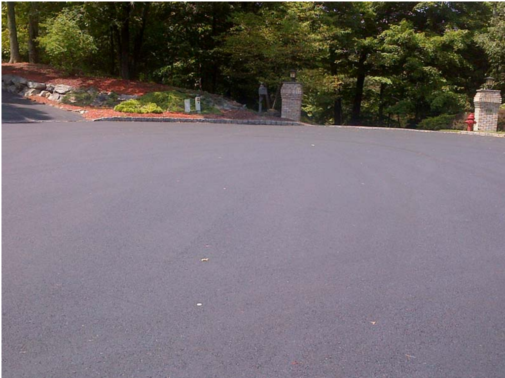
Figure 7: Cul-de-Sac on Continental