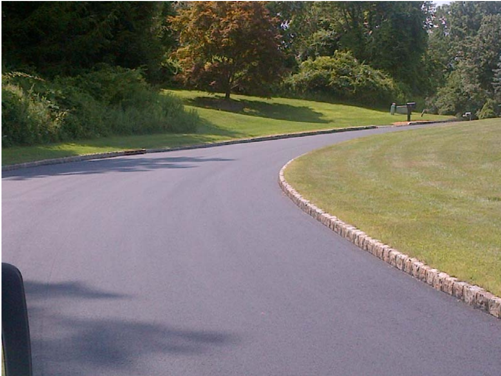
Figure 2: Skyline Drive