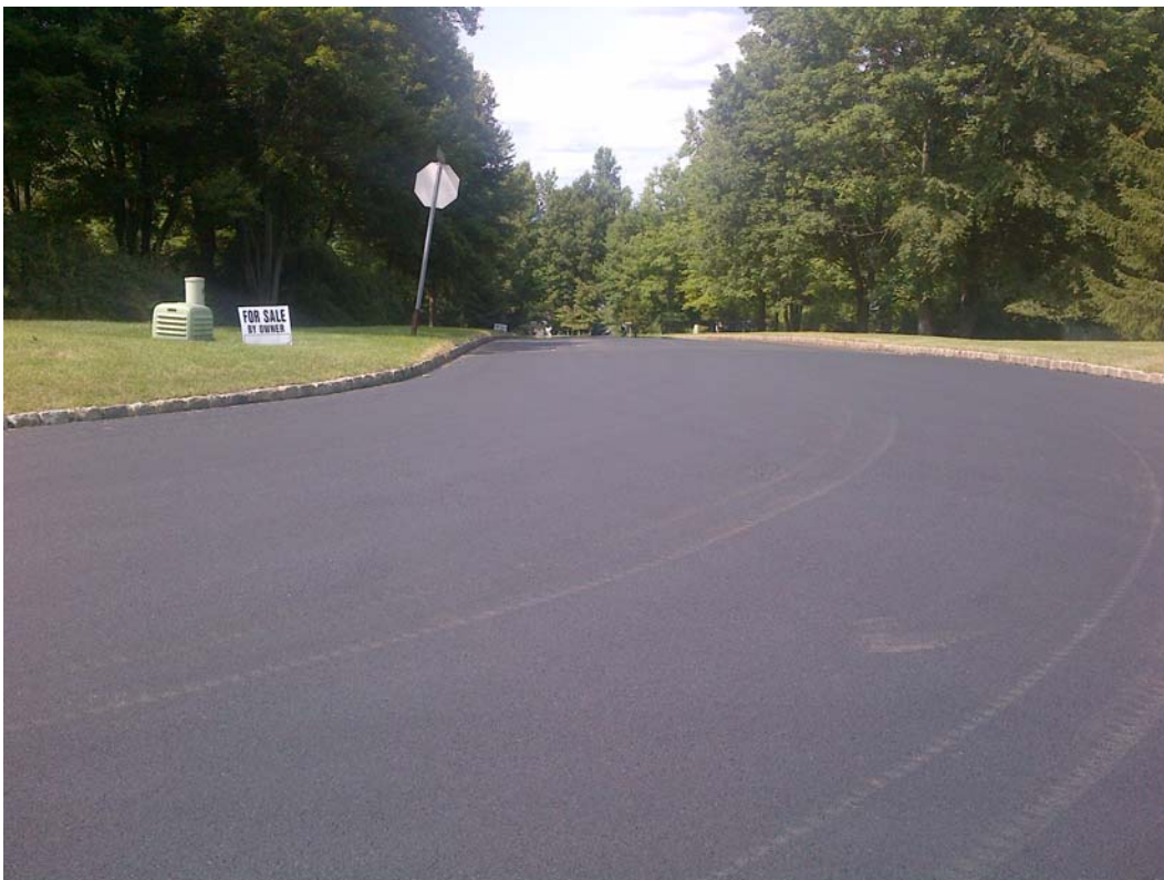
Figure 1: Grandview Terrace

The following are recent photographs of the completed work: