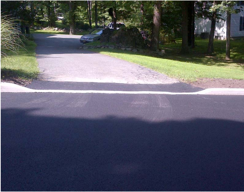
Figure 10: New Depressed Curb on Kimberly Court