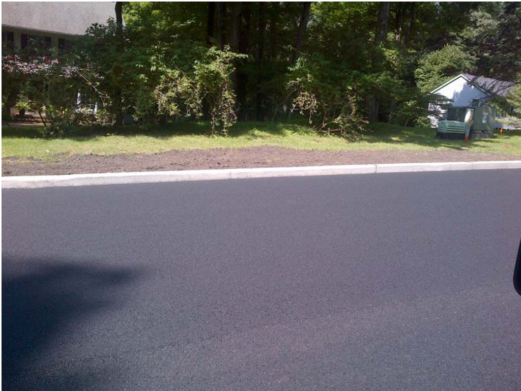
Figure 9: Curbing along Kimberly Court