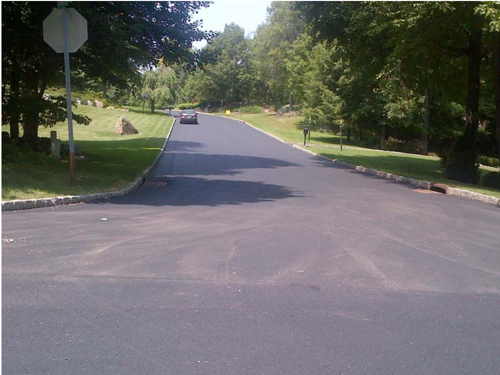
Figure 6: Continental Drive