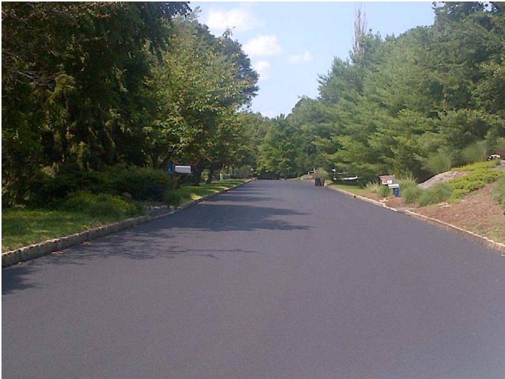
Figure 3: Skyline Drive