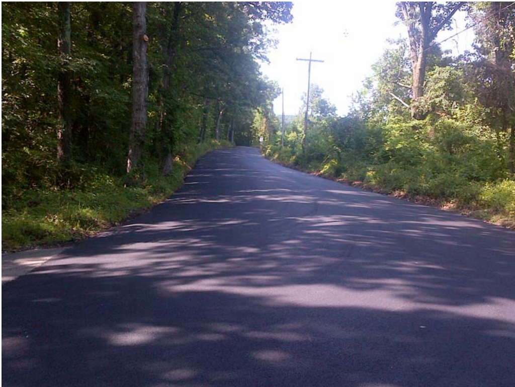
Figure 5: Wildcat Road